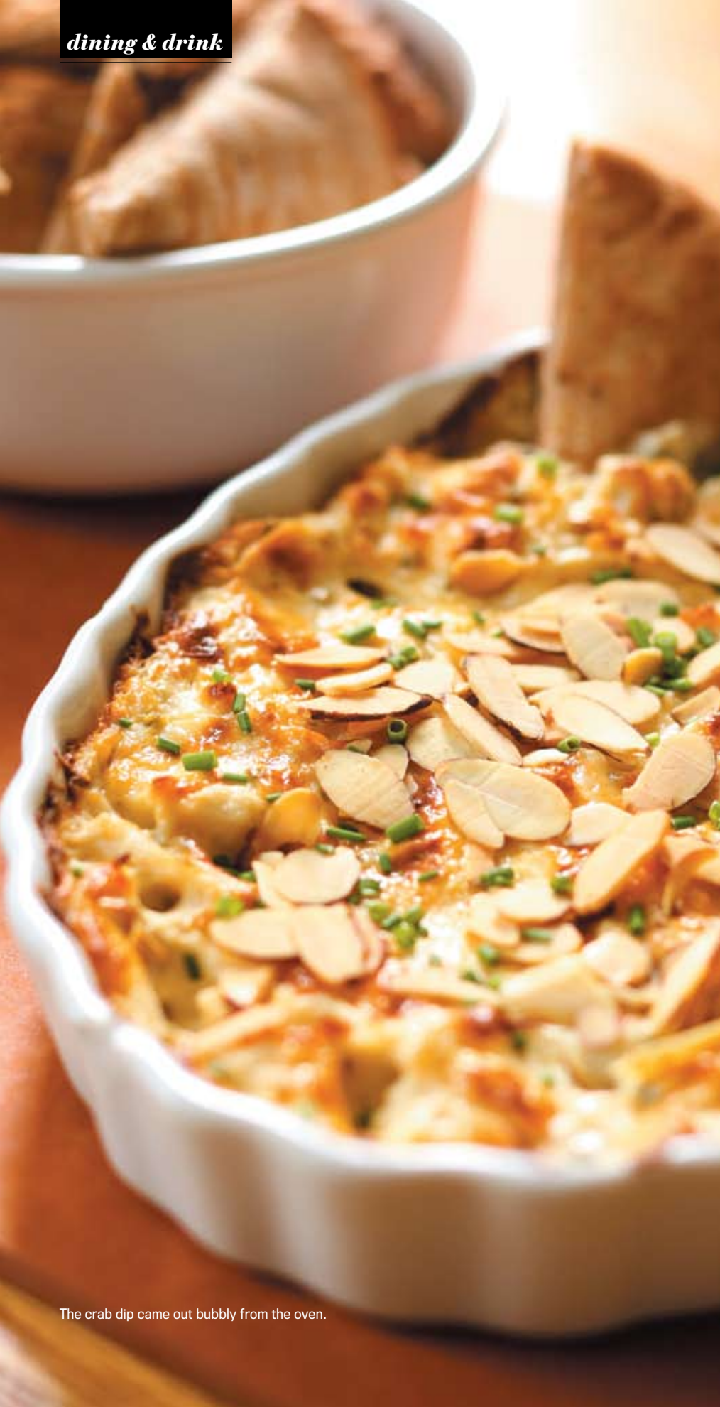
The crab dip came out bubbly from the oven.